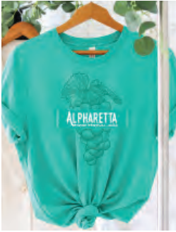
2024 Festival T-shirt $20