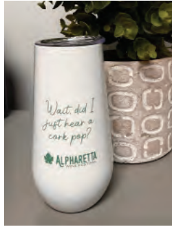
Champagne Tumblers $8